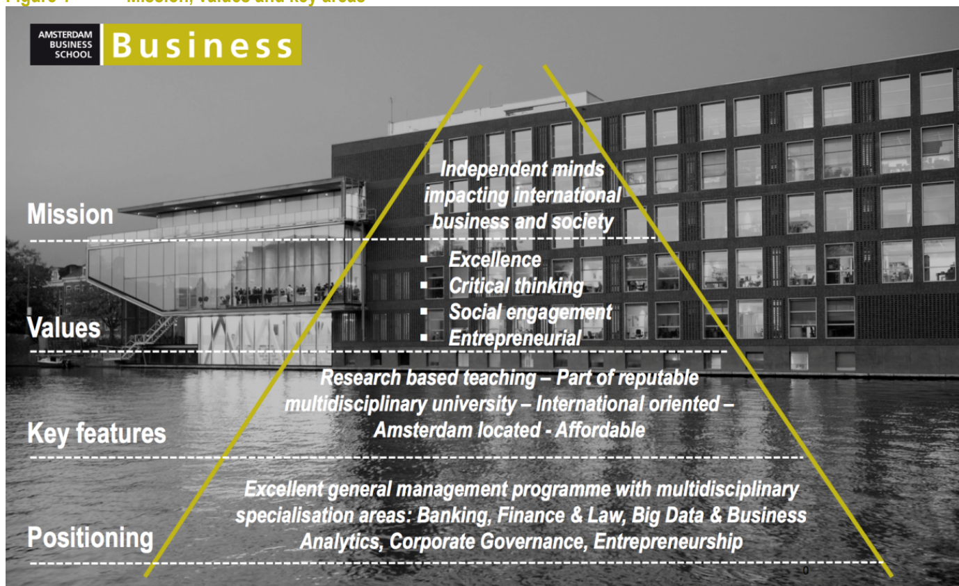
Figure 1 Mission, values and key areas